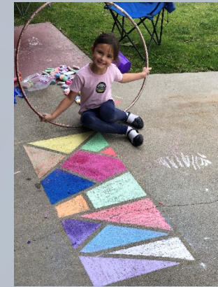
Sidewalk Chalk Design!