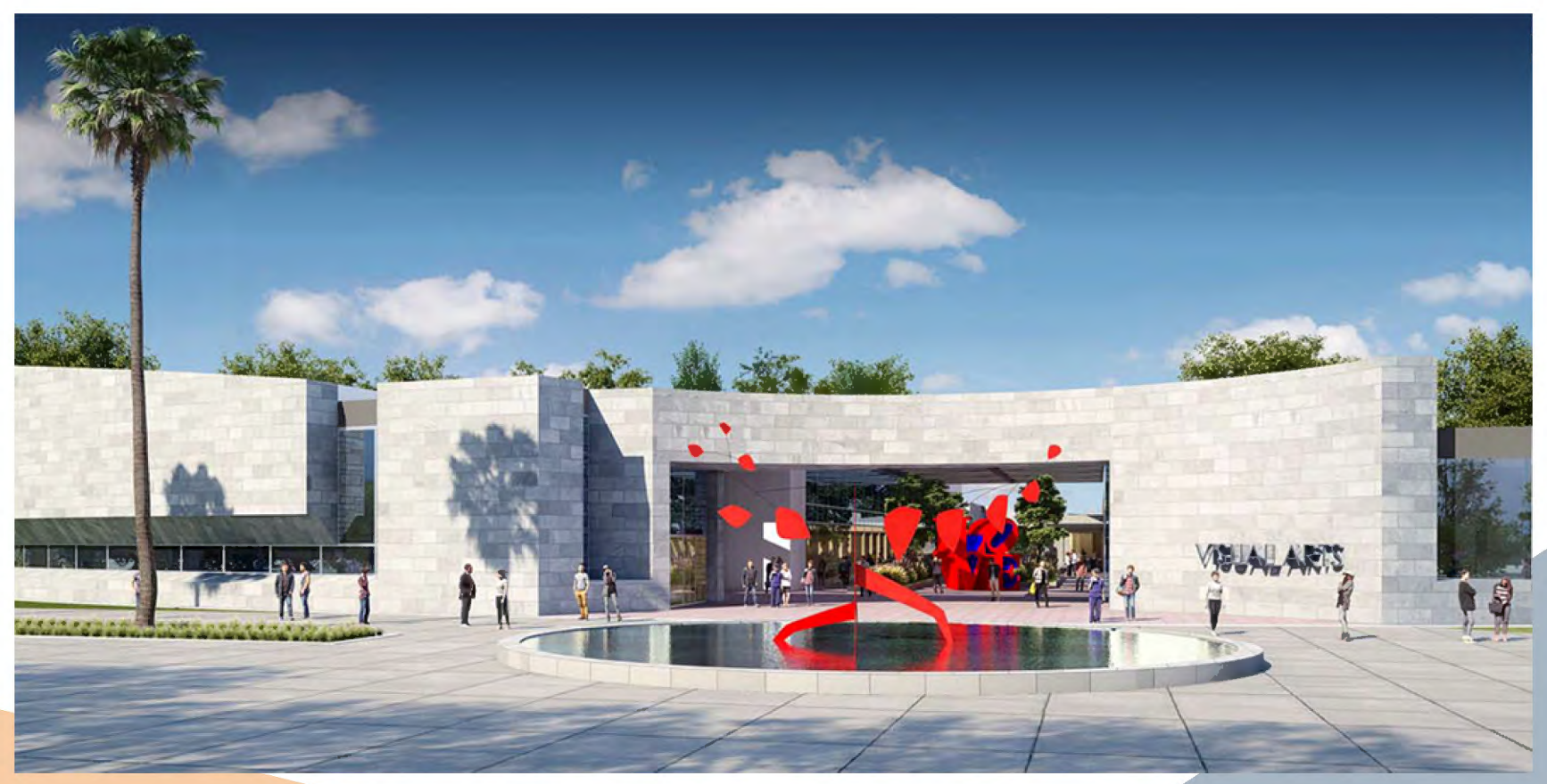
*Architectural rending from Feasibility Study