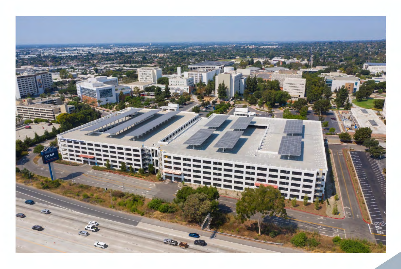
1,900 spaces reserved exclusively for student permit holders