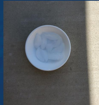
In the shade

Test this experiment outside too! Placing a container in direct sun and another in the shade.