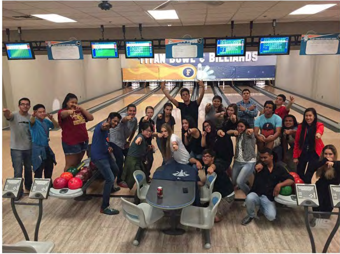
My Street Team Family