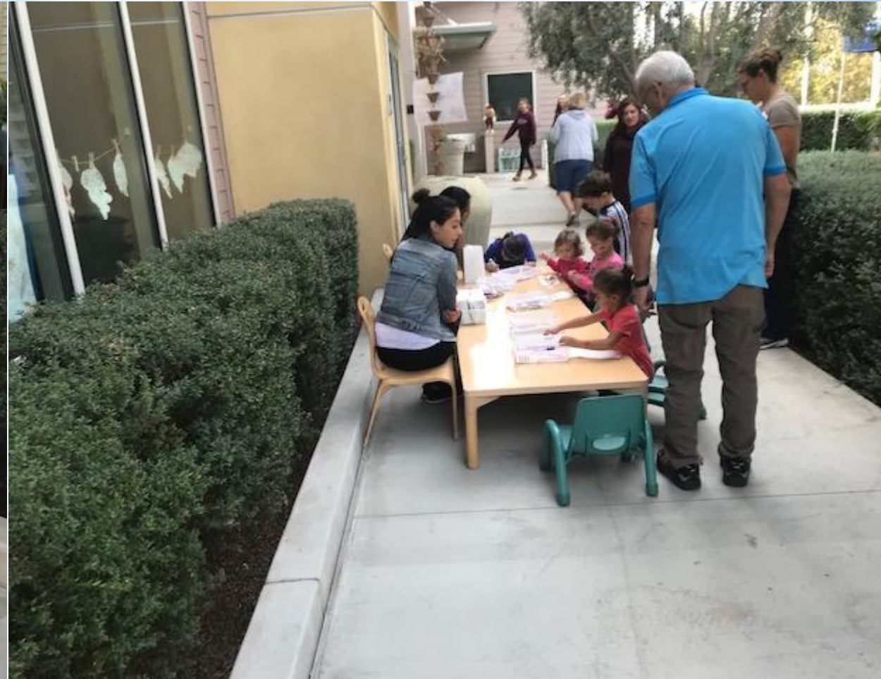
Nest Infant & Turtle Toddler Classroom