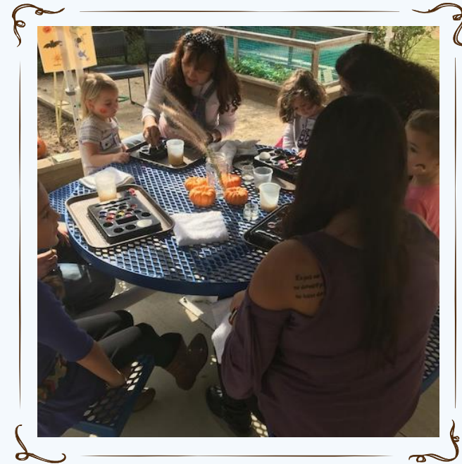
Preschool Face painting activity