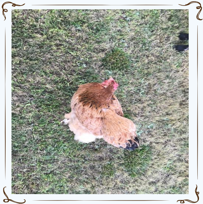
Petting Zoo Star Rooster