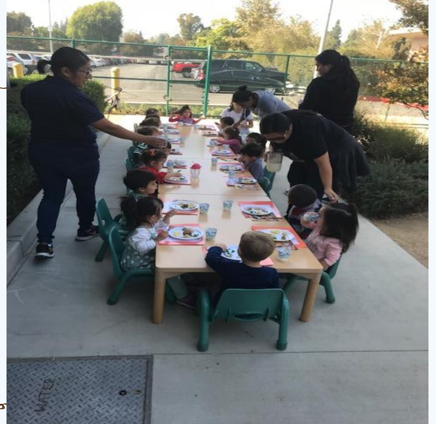
Infant & Toddler Nest and Turtle classrooms Thanksgiving feast 2017