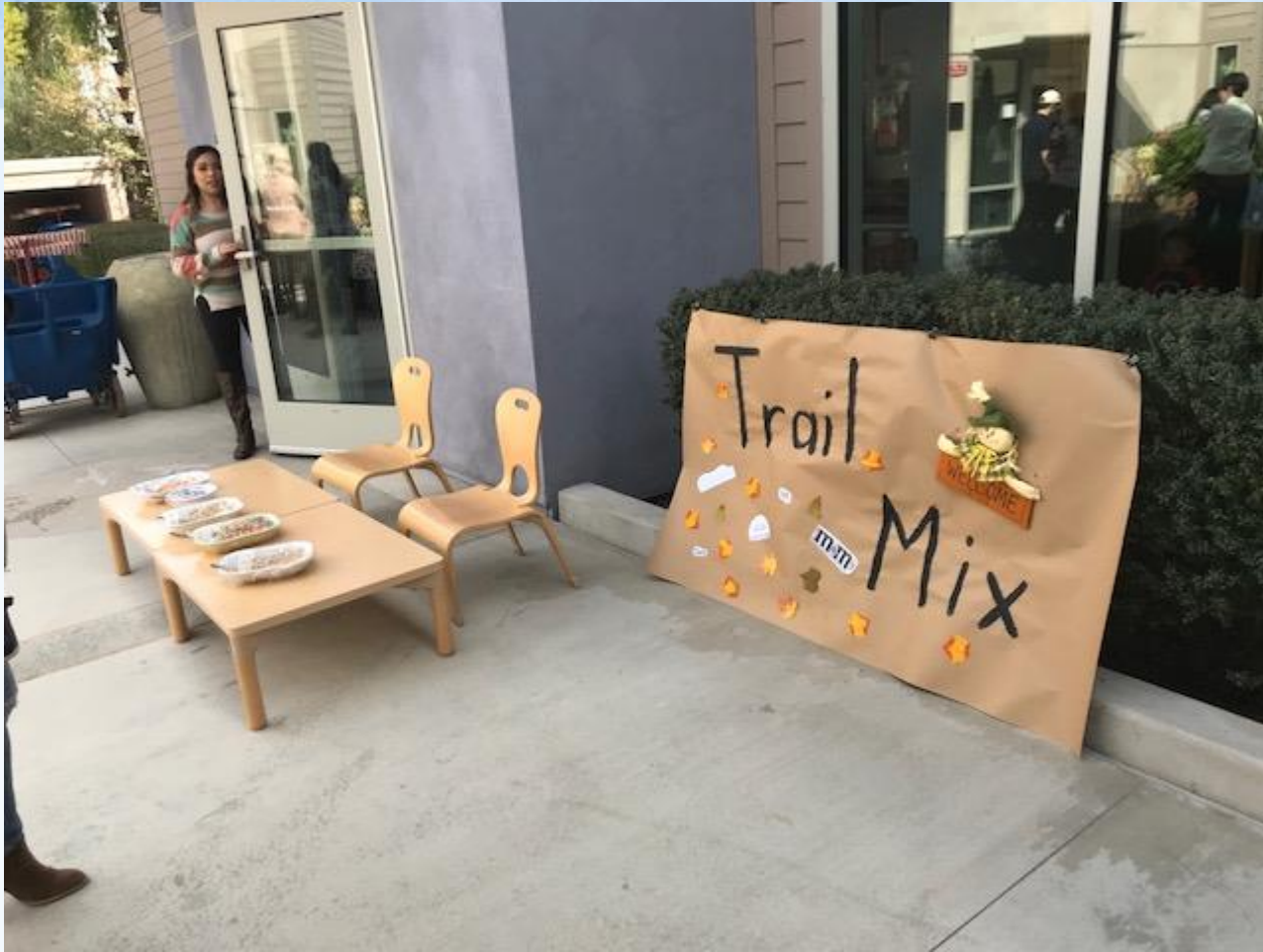
2017 Annual Country Fair