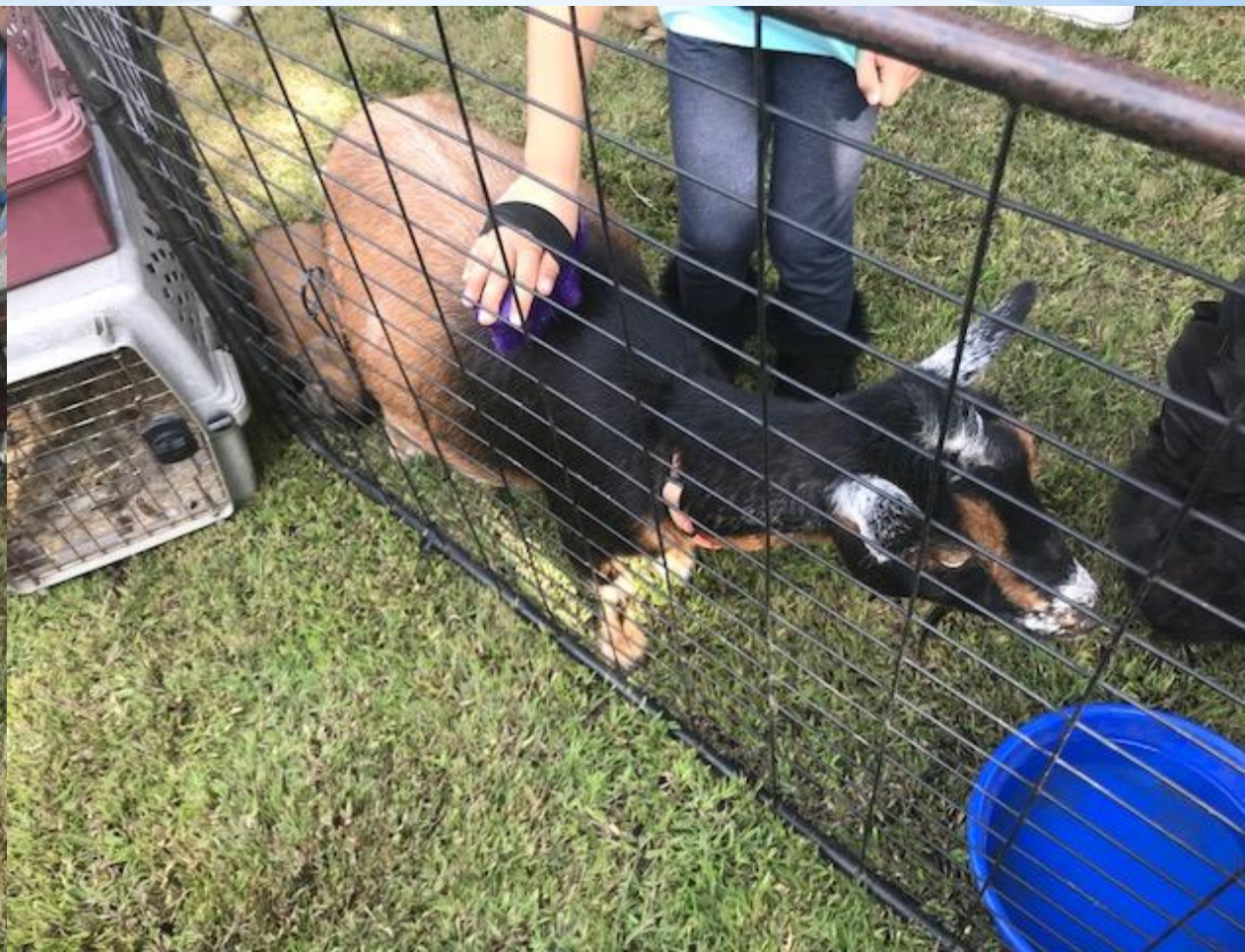
Billy Goat show