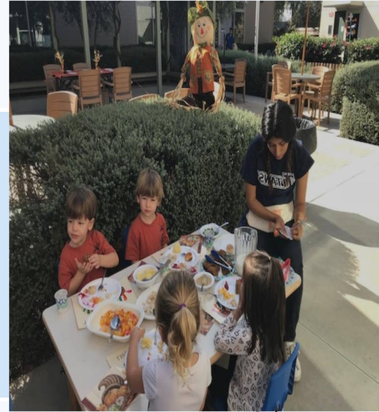
Preschool Bunny & Sunshine classrooms Thanksgiving feast 2017