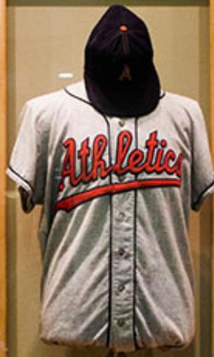
Kansas City Athletics 1955-1966