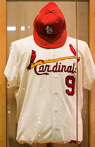
St. Louis Cardinals 1967-1968