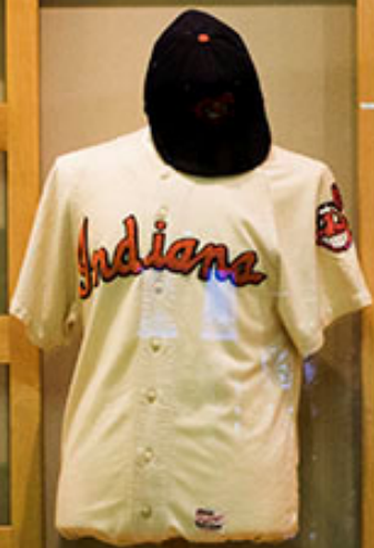
Cleveland Indians 1957-1966