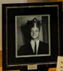
"This hit home runs not by chance but by preparation." -1968