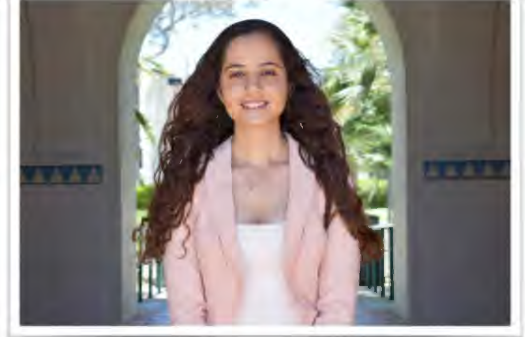
SAN DIEGO STATE