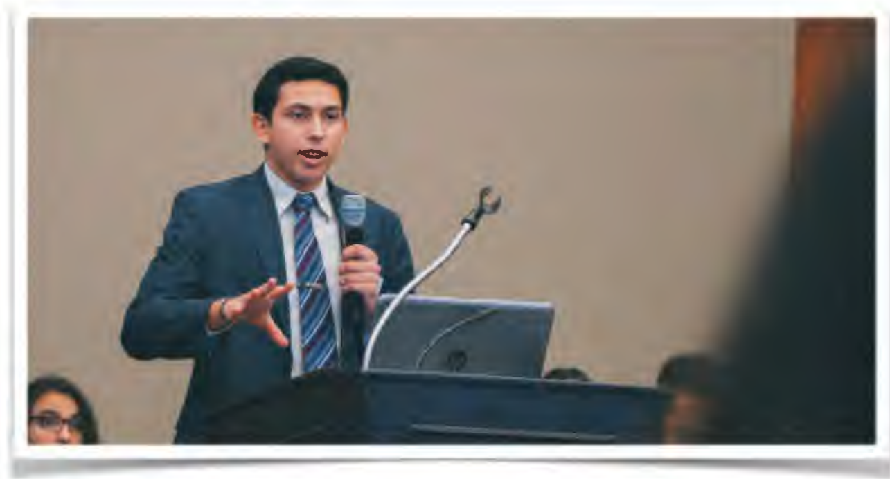
CAL POLY POMONA